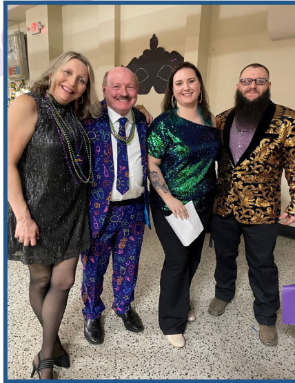
Well dressed guests at the 2022 Mardi Gras Madness

Ozanam Family Shelter was excited to host its annual dinner and auction fundraiser, Mardi Gras Madness, on February 26, 2022.